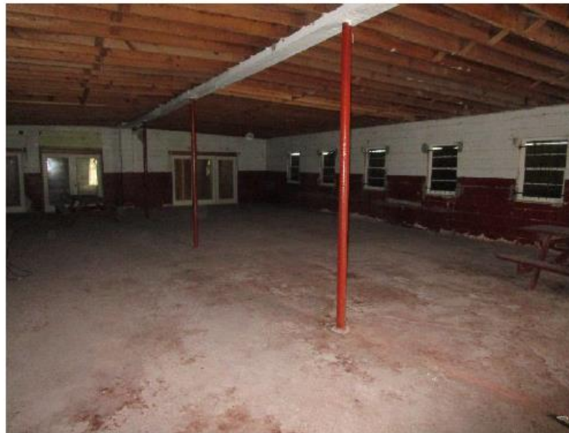
FIGURE 53. Overall view of dining room.