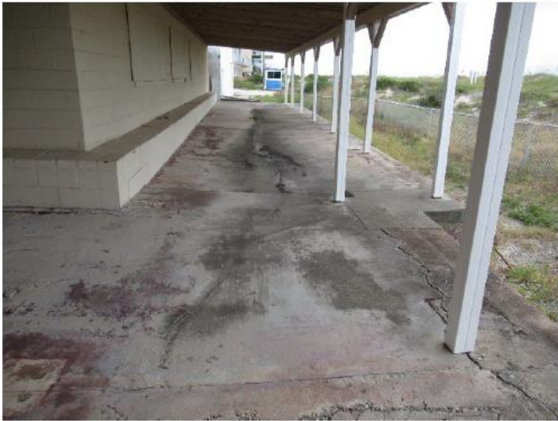
FIGURE 97. Middle of elevated slab displaced downward.