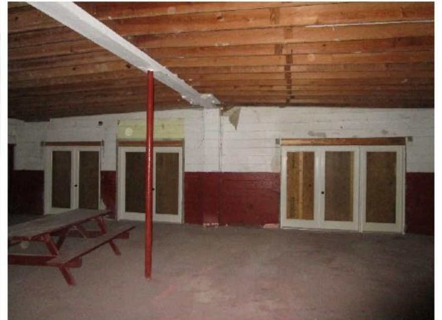
FIGURE 41. Interior view of replacement French doors on east facade.